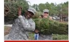
DOUGLAS FIR 6' - 7' TREE $66