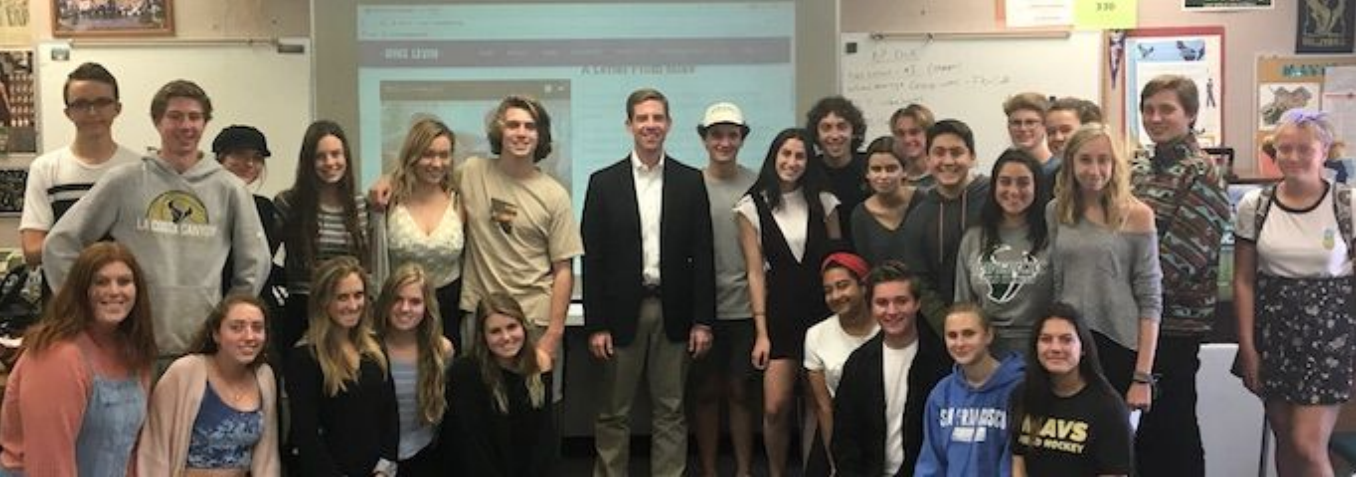
Young Activist Club group photo in a community room.

Young Activist Club: Young Activist Club... Save the Dates... Nov. 9, from 6-8pm... Screenagers Movie Showing: V@:1^A q1^1^A @ q * 1^1^A Gwyybu Yfg.; fck jbl 'l d'j'b'h Y8]] j1U'5] Y6A