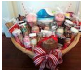
example: ice cream heaven