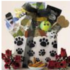
example: doggie bag