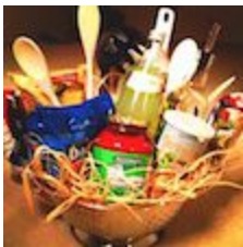
example: pasta perfection