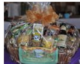
example: beer lover