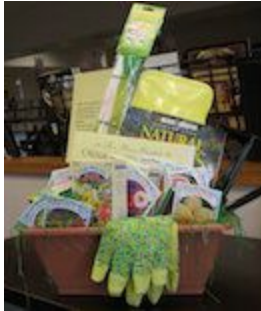
example: gardener's planter